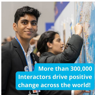
More than 300,000 Interactors drive positive change across the world!