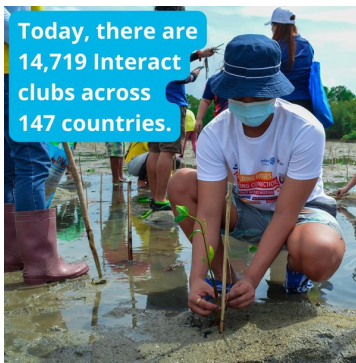
Today, there are 14,719 Interact clubs across 147 countries.