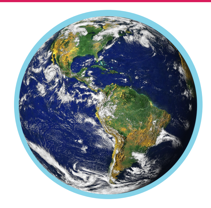
One Day. One Focus: Ending Polio 24 October World Polio Day

First picture we have received of one of the Peace Poles installed. In this picture is Jack Cohen, District Governor of Rotary District 7280 whose Club purchased a Peace Pole from our District's Interact. The picture was taken at the dedication which was held on World Peace Day. The peace pole is located inside and Jack says that it revolves to display all four languages.